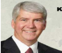
KEYNOTE SPEAKER: Michigan Governor RICK SNYDER